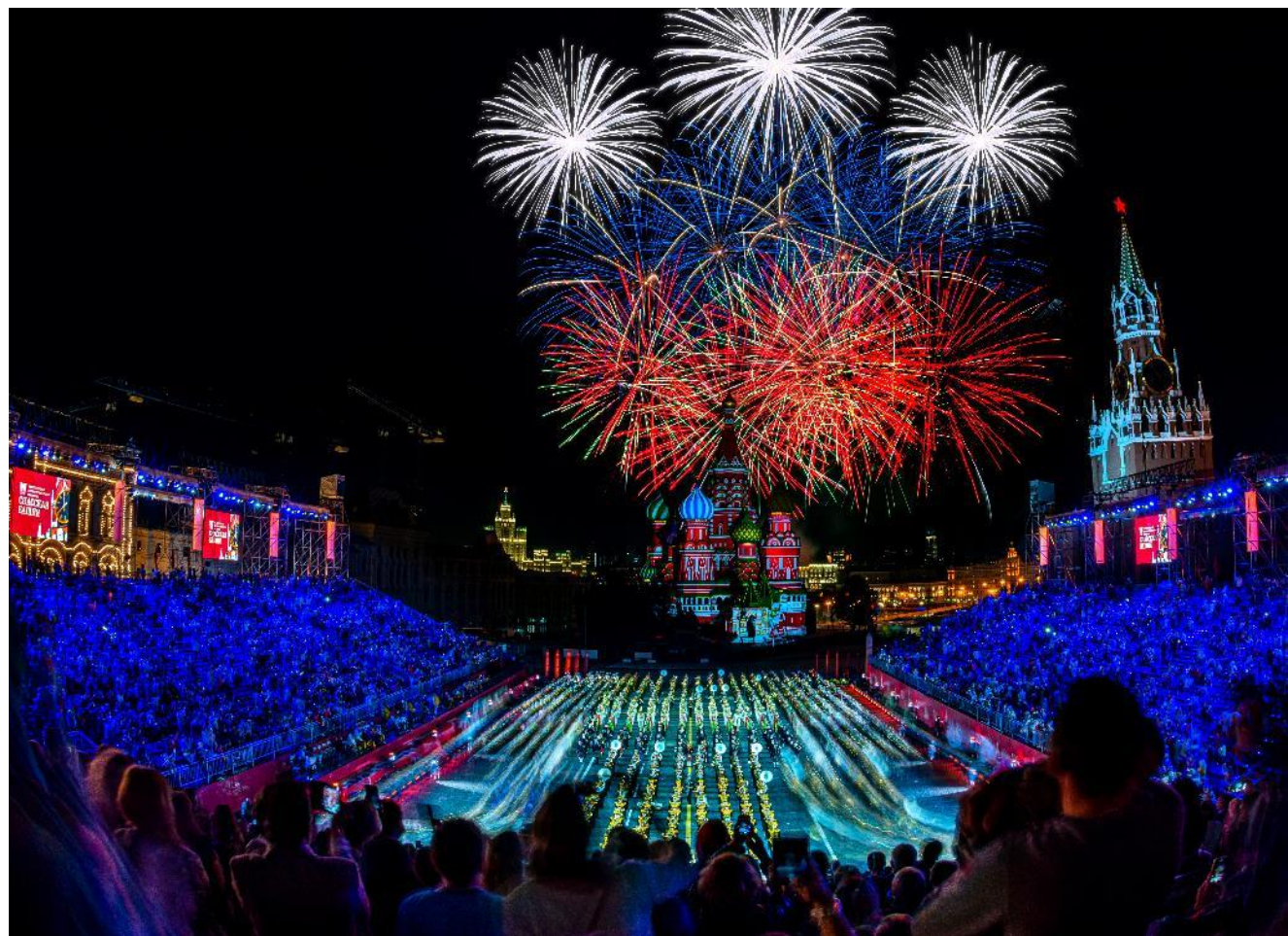
The Spasskaya Tower Festival, Red Square, Moscow, 2022 photo

as well as on more than 30 sites in MOSCOW and ST. PETERSBURG