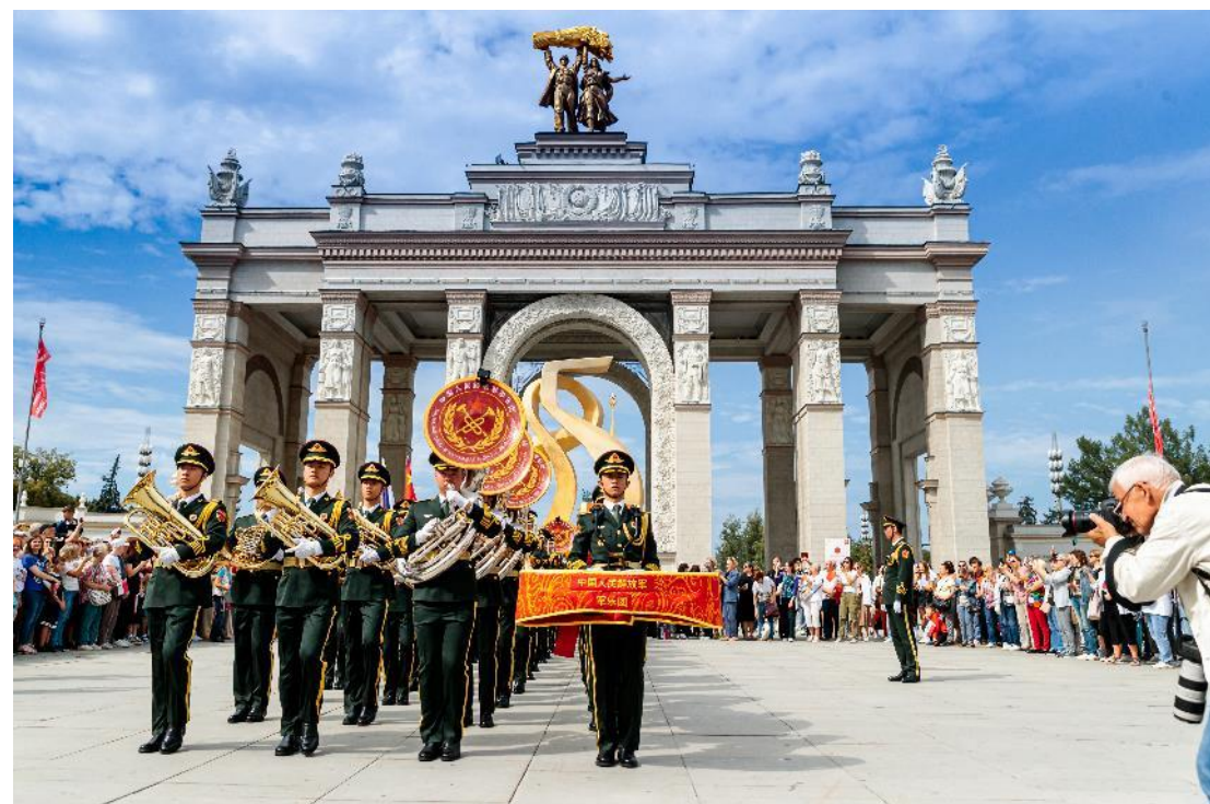
Entrance is free